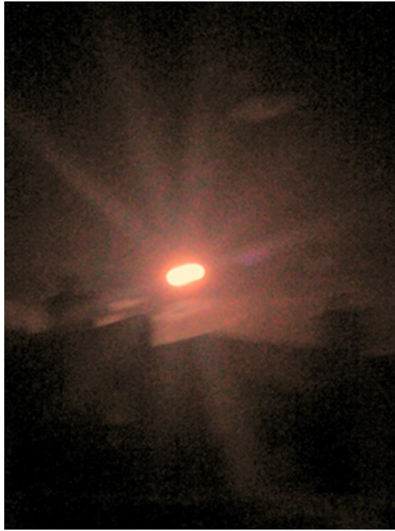
Starship over Santa Fe, New Mexico – Mar 2021

They have badly underestimated the power of these, even now, as they receive one warning after another that their rule is ended, yet choose to disregard and scoff at the idea.